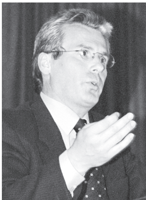
Judge Baltasar Garzón.

T he 74th annual Bay Area reunion of the Abraham Lincoln Brigade, held in Berkeley, California, on May 30, paid tribute to the legal work of Judge Baltasar Garzón in challenging decades of silence about mass murders conducted during the Spanish Civil War and the subsequent dictatorship of General Francisco Franco. The program, part of ALBA's focus on issues of historical memory and human rights, focused attention on the continuing struggle for justice in Spain today.